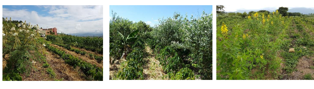
Tephrosia vogelii Cajanus cajan Crotalaria sp